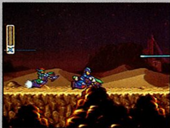
Mega Man X races to the abandoned reploid factory today.

A special armada of Maverick Hunters was mobilized today to the production factory, but only one reploid has been able to penetrate the heavy artillery outside the factory.